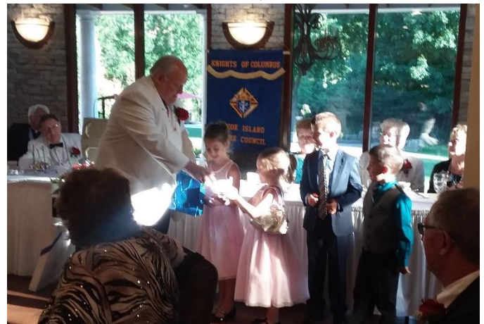
SD Dziok's grandchildren gifting him a gavel