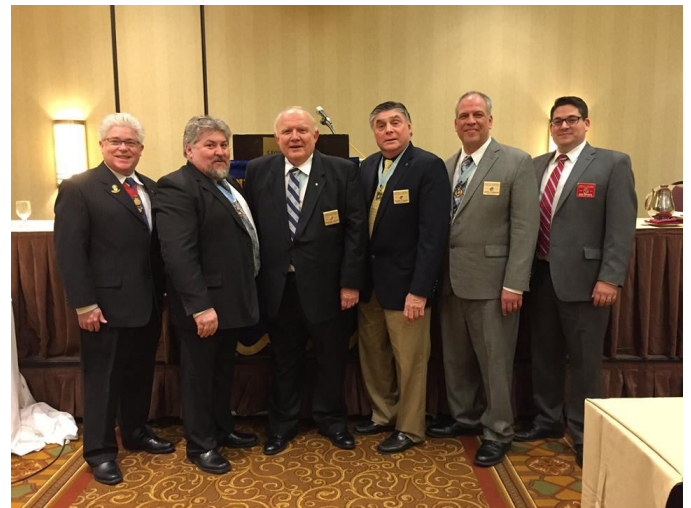
Fraternal Year 2018-2019 State Officers-elect